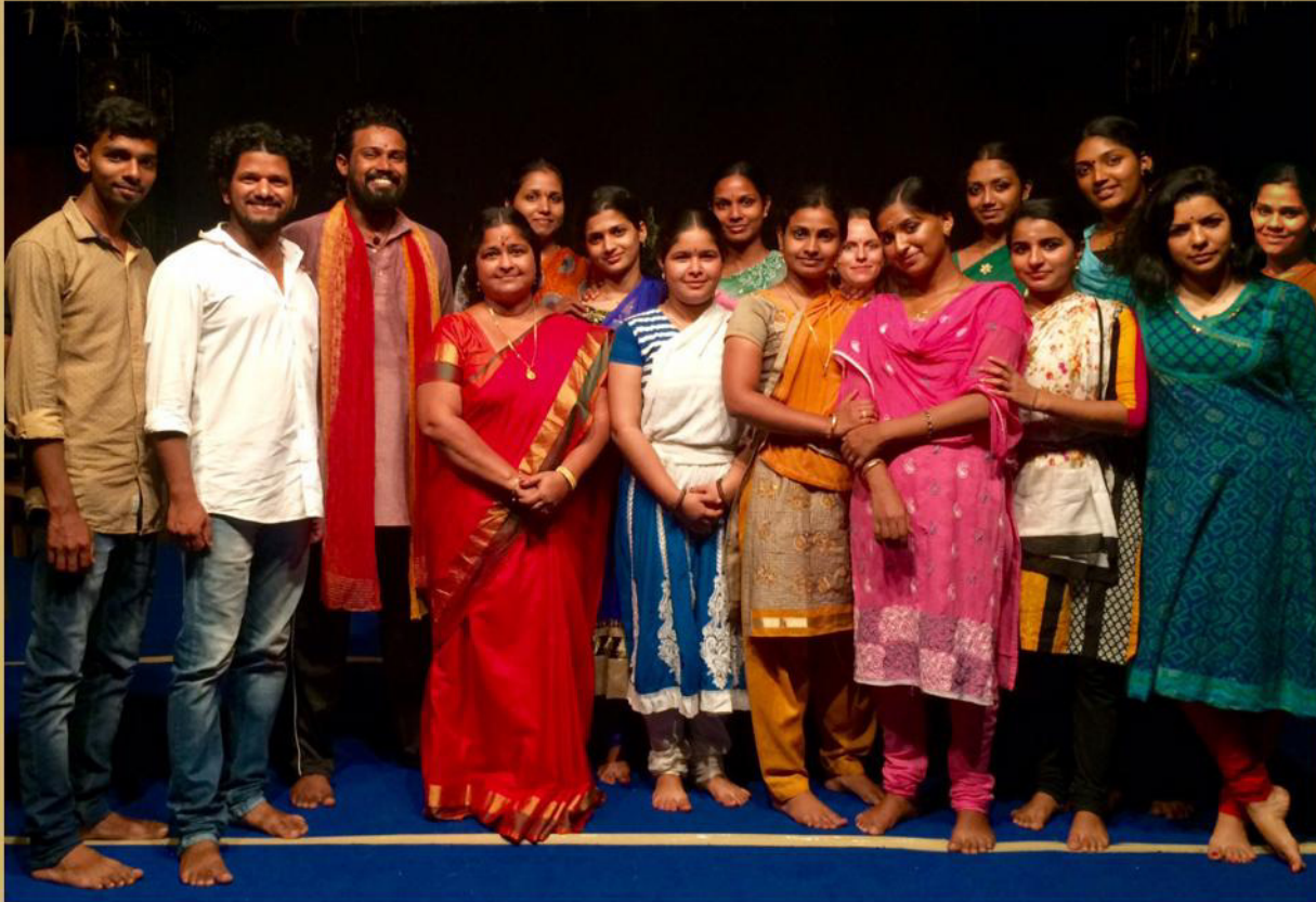
The team - Galaxy of Musicians