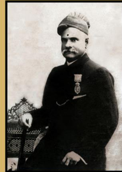
Raja Ravi Varma

His realistic portrayals and interpretations of religious and mythological figures that adorn the households today, captivated and fascinated the country as well as an international audience.